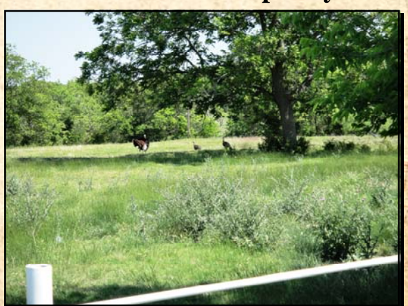
Stock pond, small creek, 18 minutes north of Weatherford. Price $735,750.00.