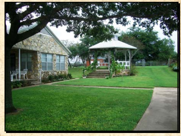
Older rock home built in the 40's, barns, workshop, and cattle pens.