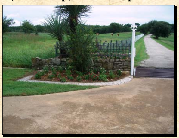
Rolling pasture land with scattered oak trees. Water well and septic system.