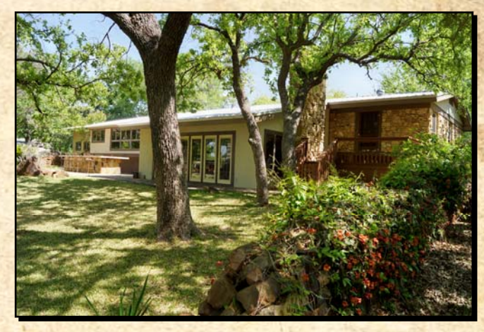
3,000 sq. ft. stone home with 3 bedrooms, 2 baths and a 2 car garage.