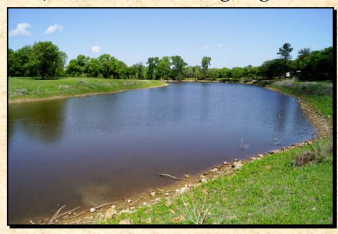
Flagstone deck, pool, outdoor bar, and an 8 acre private lake.