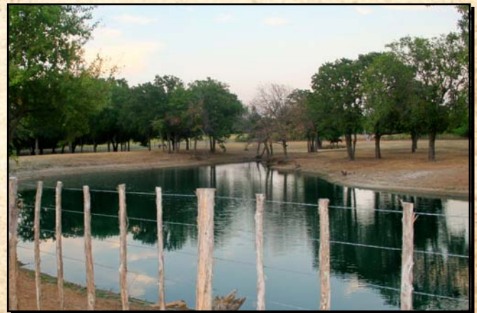
2 helper quarters, equipment sheds, cedar stave entry & fencing. $ 1,850,000.