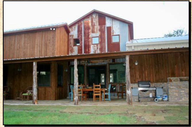
A beautiful high end rustic 2408 sq. ft. 2br - 3ba home with stone & cedar exterior.