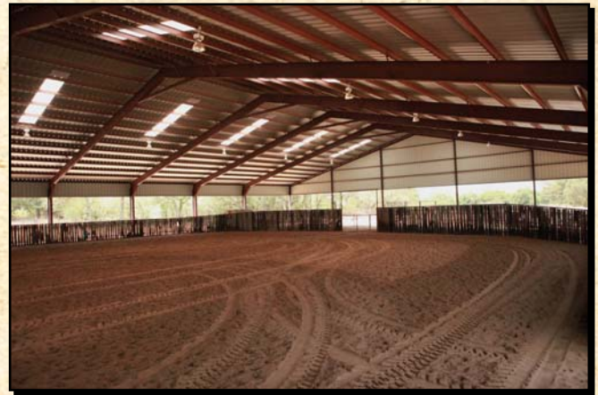
Awesome covered arena 130x260, 2 barns with 16 stalls, covered free flow walker.