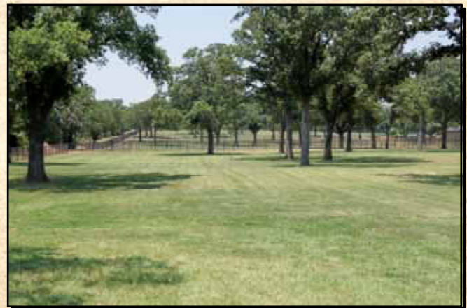
Gently rolling sandy soil with scattered trees & seeded. Pipe & stave fencing. $1,795,000.