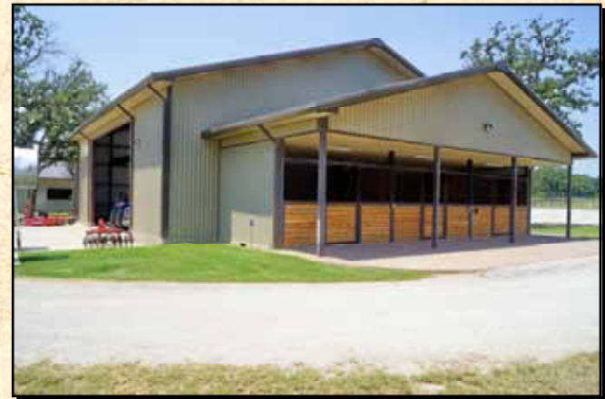
Foreman's home & apartment. Equipment, storage & shed row horse barn.