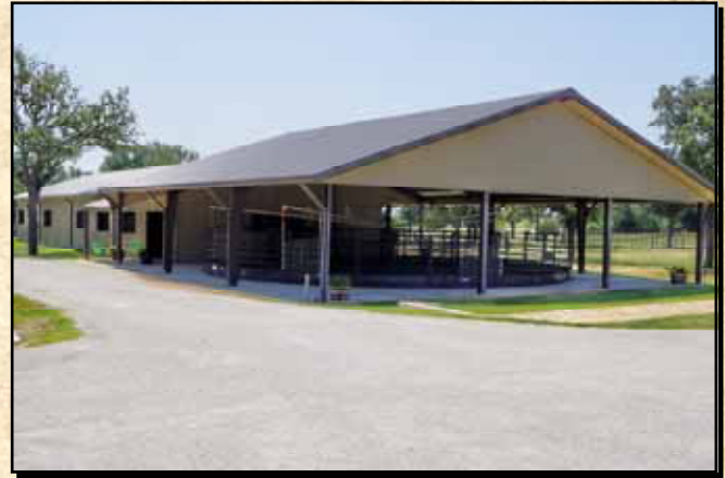
A 3500 SF 3-2.5-3 limestone home. Outstanding horse barn with covered panel walker.