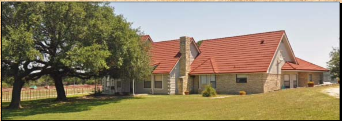
A 3,000 sq. ft. 3 bedroom 2.5 bath stone ranch style home. $1,695,000.00