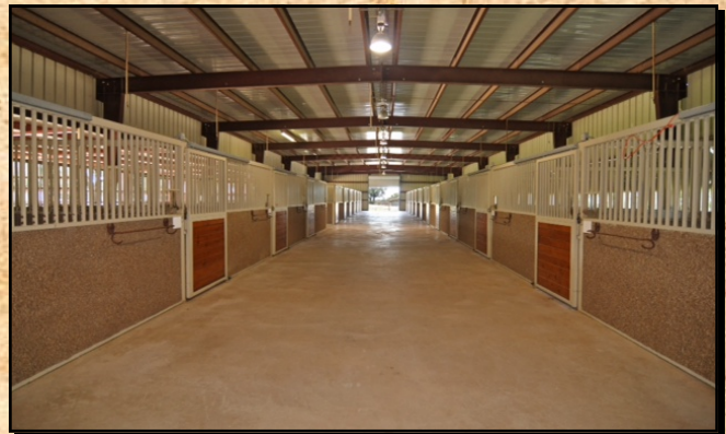
Covered arena, 37 stall barn, kitchen/vet room and 400 sq. ft. apartment.