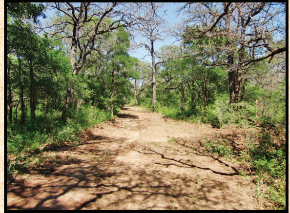
West Fork of the Trinity River & Lost Creek frontage.