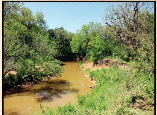
Excellent whitetail, turkey and hog hunting