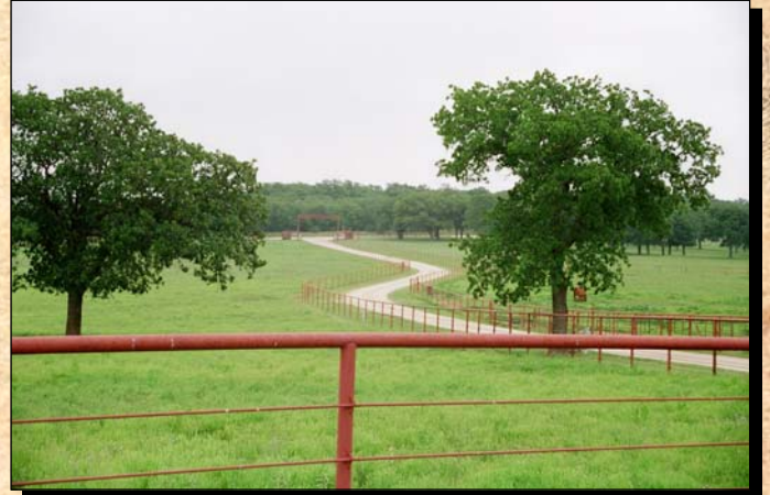
Beautiful rolling terrain & bottom land with coastal bermuda & scattered trees