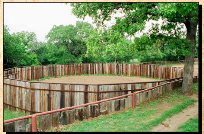
Hay barn, equipment shed, 2 round pens, small creek — Reduced to $750,000