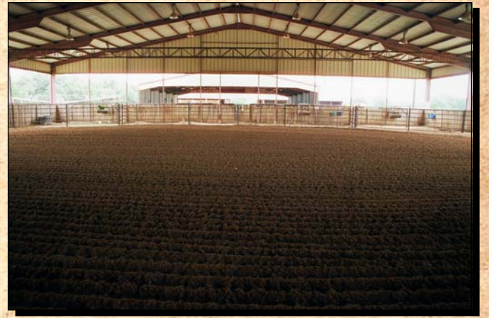
Covered arena, 2 horse barns, panel walker, 3 mobile homes, pipe & cable fencing