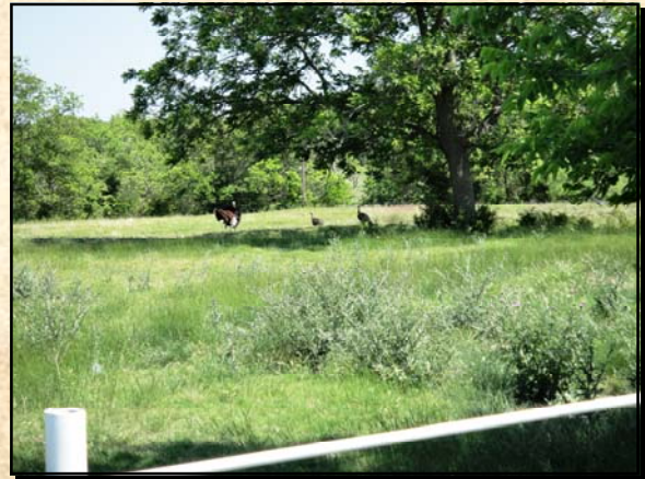
Stock pond, small creek, 18 minutes north of Weatherford. Price $735,750.00.