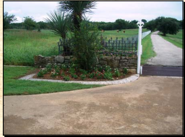
Rolling pasture land with scattered oak trees. Water well and septic system.