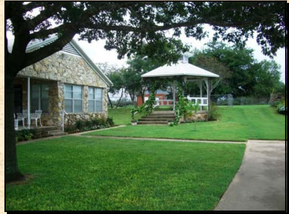
Older rock home built in the 40's, barns, workshop, and cattle pens.