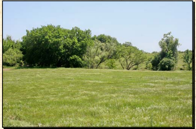
Cultivation land, 3 ponds, creek, pecan trees, & paved frontage.