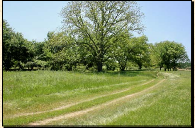
Rolling land with some scattered trees, native & coastal grasses.