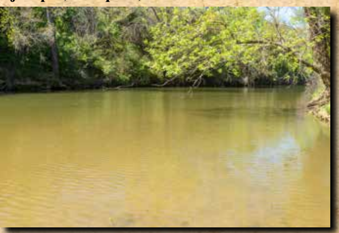
Gorgeous "Keechi Creek" traverses through the northeast quadrant displaying large pools of water.