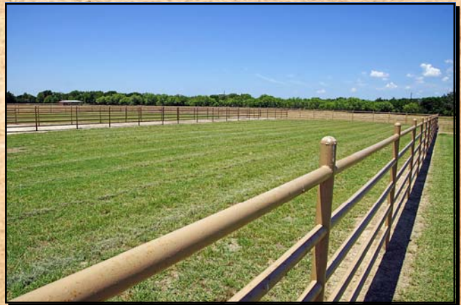
Several barns, new all steel roping arena, lots of pipe fencing & gated entry. $859,500.00