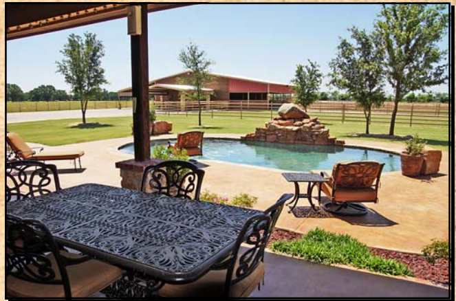
A very nice 3 stall horse barn w/super nice apartment, tack, shop & covered storage.