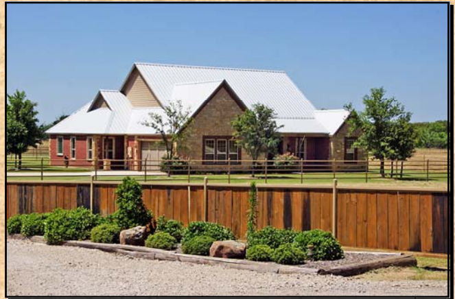
A 2775 sq. ft. 3-3-2 stone & brick home with pool & waterfall, and a metal roof.