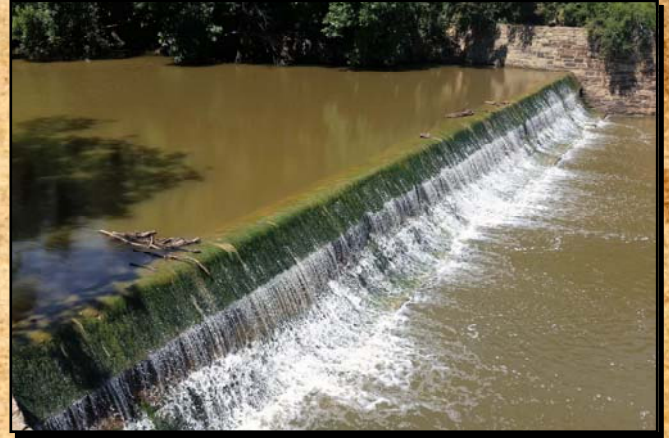
Scenic "Keechi Creek" meanders through this paradise with a man-made dam & water fall.