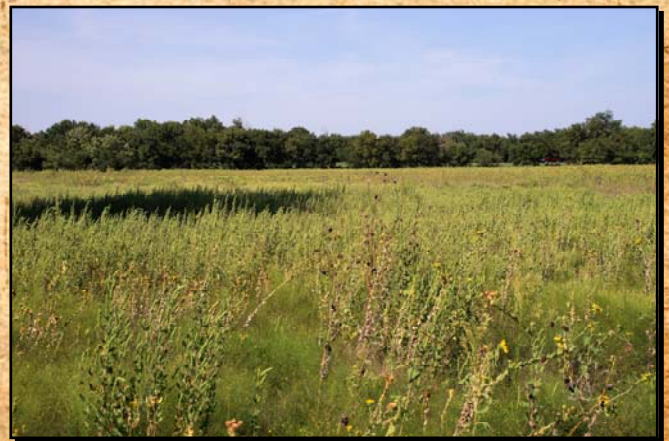
Excellent scenic game cover & fields, big trees, 100% minerals. $1,397,500.00.