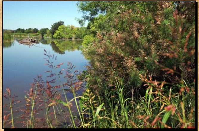
Extensive frontage on large “Long Creek” and “Lake Granbury”.