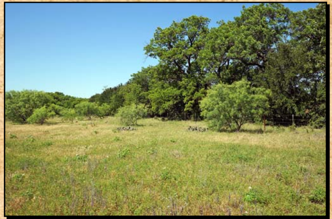
Gently sloping to level older farm land with terraces, now mostly in mesquites.